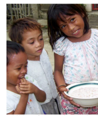
Children from Aklan excited for their food with Vitameal

Typhoon Frank devastated several provinces when it came last June. Because of this, Feed the Children Philippines was immediately contacted for Vitameal to be sent to the provinces of Aklan and Antique which are two of the provinces that were submerged in deep murky waters and in uncertainties of how to get up from this ordeal.