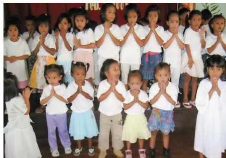
Hapag-Asa graduates from the Parish of St. Jude, Archdiocese of Davao