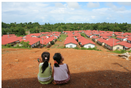
Two children from Infanta, gazing over their JP II Village.